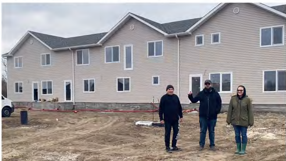
The main building at Camp Dumbraveni will serve the Constanta community year round with camps and conferences.