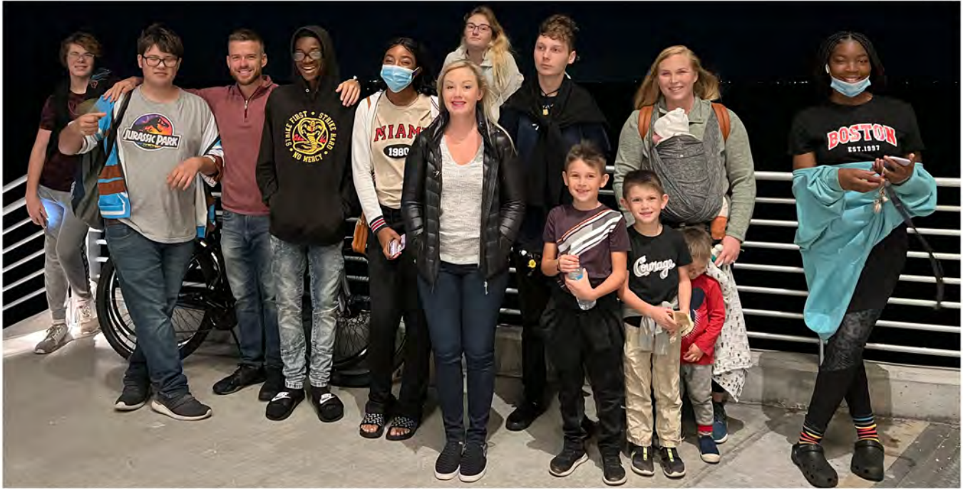
Our youth group went to the new St. Pete Pier, had a blast, and even ran through the water jet fountain. We had prayer and a word from the Lord in the grass under God's great cathedral of the stars.