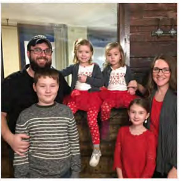
The whole White family