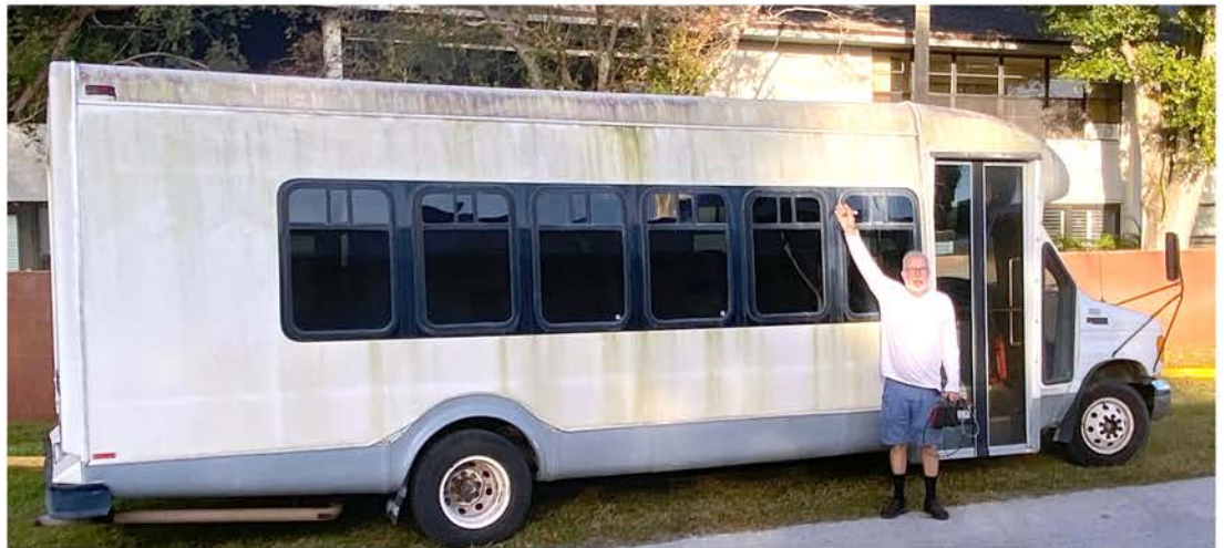
GT Church people mover finds a new home at the Christian Outreach Center