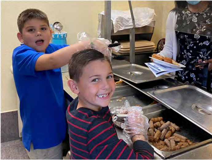
First the panake breakfast!