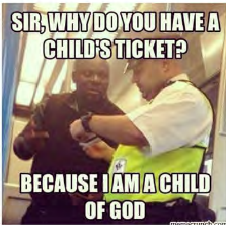
Jesus was here