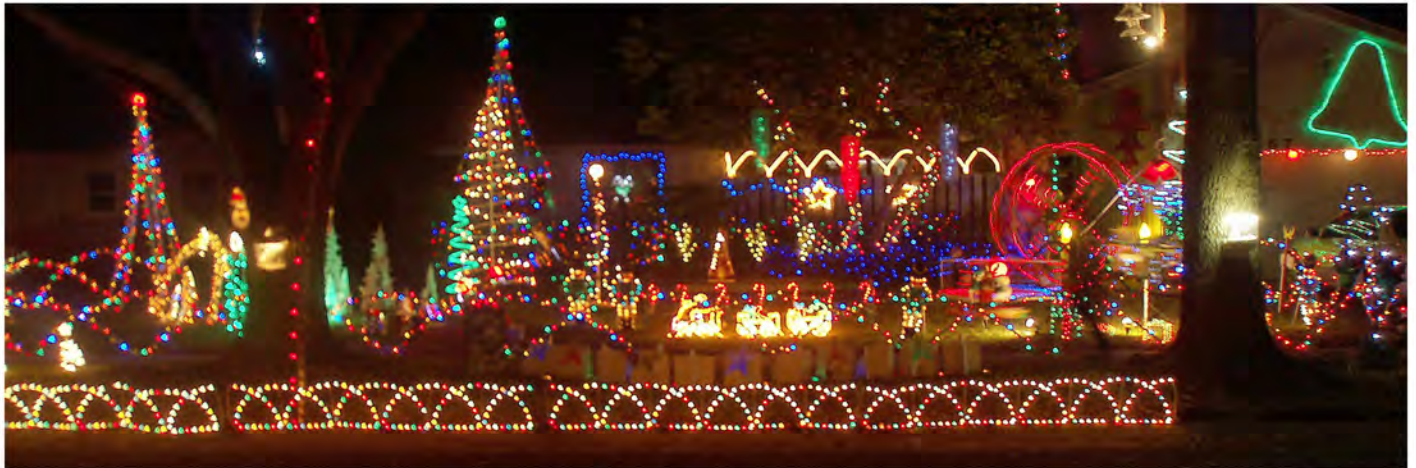
The GT Youth rode the church van to a popular Christmas lights neighborhood on the evening of December 16. They enjoyed homemade sugar cookies and cupcakes while they fellowshiped together. The youth also had a powerful time of prayer and praise reports.