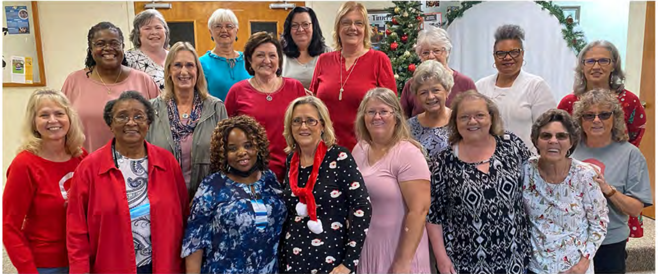
GT Church ladies went shopping on December 7 in Bradenton and had lunch at Der Dutchman Amish Restaurant in Sarasota